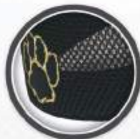
STRETCH-FIT (STRETCH FABRICS ONLY) *144 PIECE MINIMUM PER SIZE