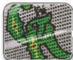
screen print on mesh