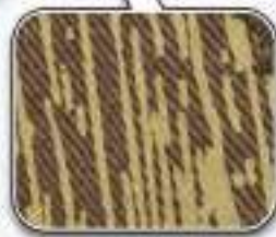
screen printed front panels & top visor