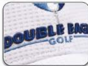
3-D & flat embroidery