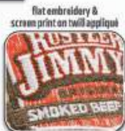
flat embroidery & screen print on twill applique