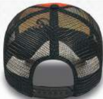
adjustable plastic snap tab

structured medium profile 5 panel cap 100% polyester & lightweight brushed cotton twill with trucker mesh back