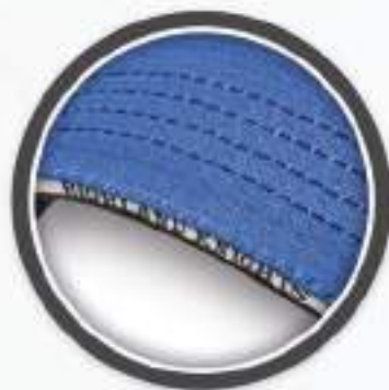
SANDWICH VISOR (SOLID OR WOVEN)