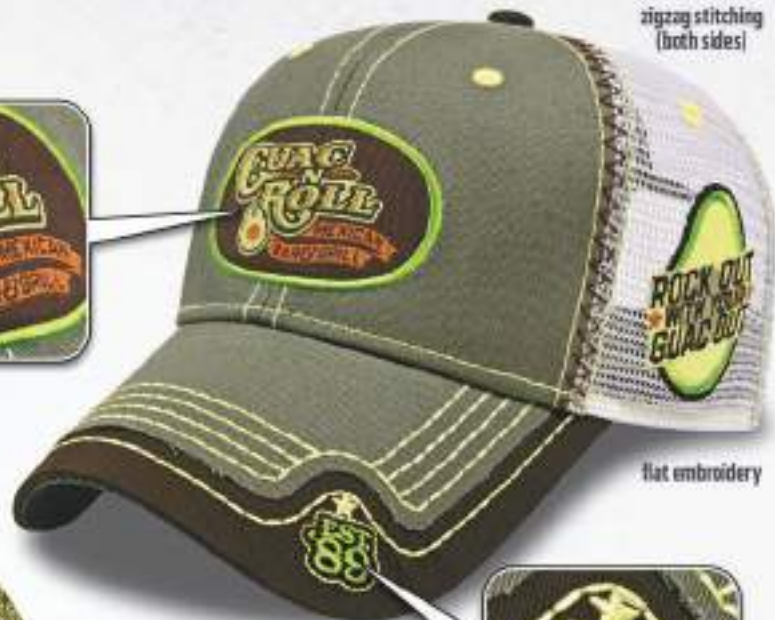
zigzag stitching (both sides)