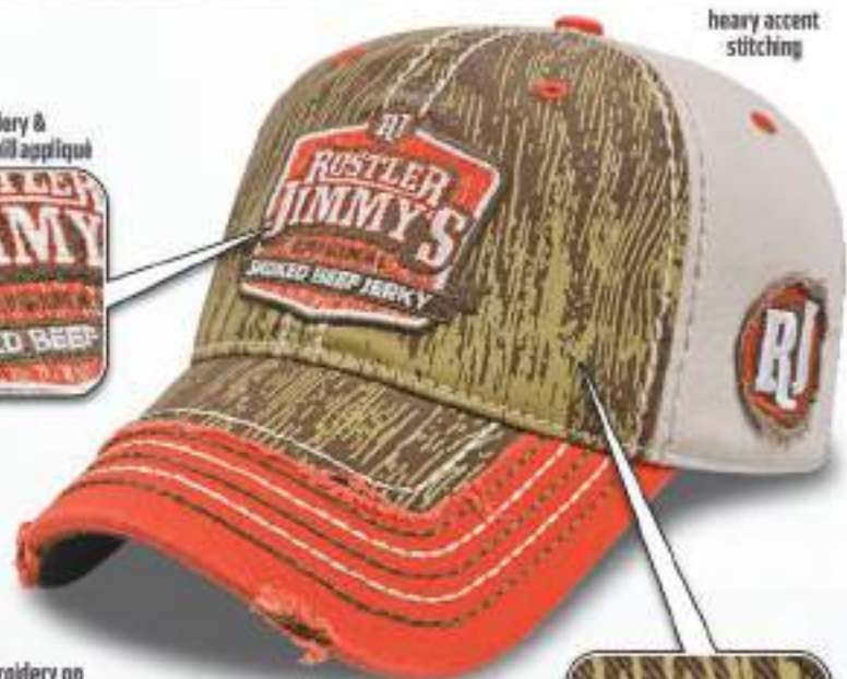
heavy accent stitching