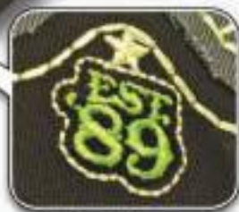
flat embroidery on chino twill visor insert