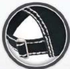
FABRIC STRAP WITH METAL SLIDING BUCKLE