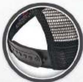
ADJUSTABLE PLASTIC SNAP TAB