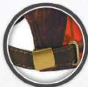
FABRIC STRAP WITH METAL BUCKLE & GROMMET