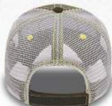
fabric strap with two piece velcro

structured medium profile 6 panel cap chino twill with trucker mesh