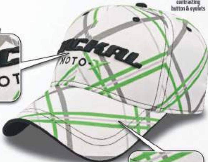
contrasting button & eyelets