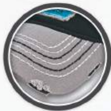
WASHED & FRAVED (ON TWILL FABRICS)