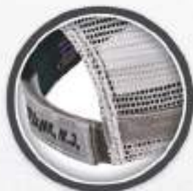
FABRIC STRAP WITH TWO PIECE VELCRO