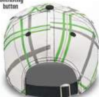
cloth strap with sliding silver buckle